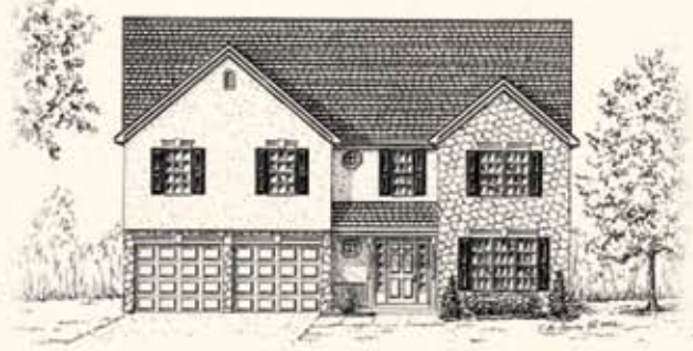
Elevation C AM-C-OR-0503

Shown with optional: Hip roof, custom square porch posts with arch and dining room bump-out