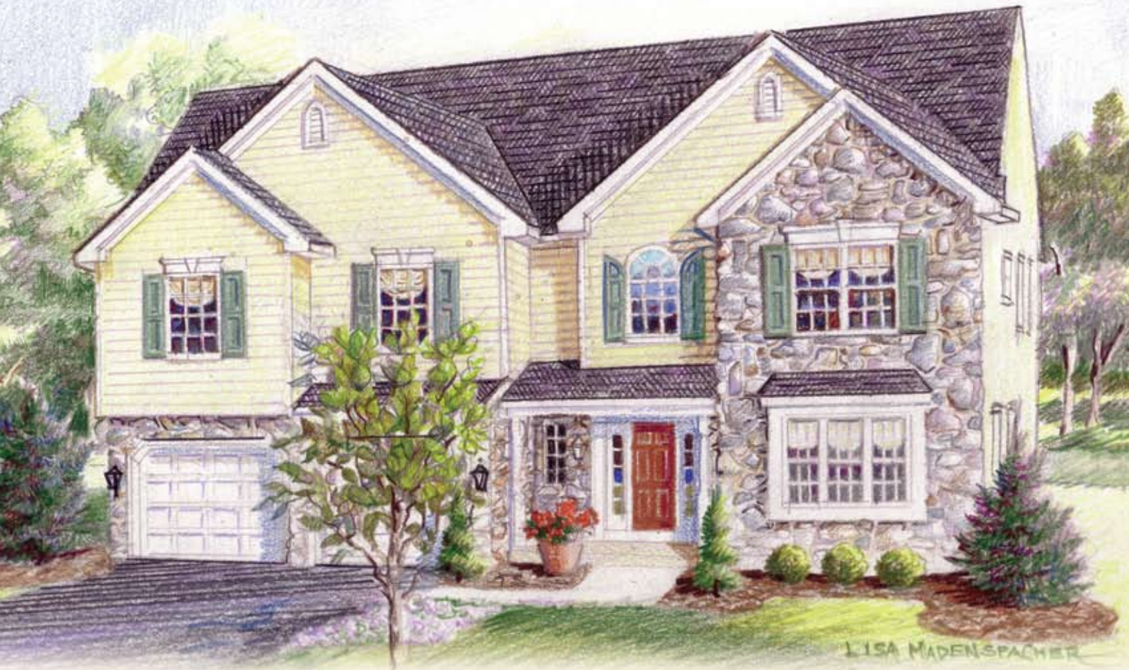
Elevation A AM-A-OR-0501

Shown with optional: Custom square porch posts