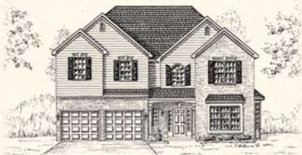
Elevation B AM-B-OR-0502

Shown with optional: Custom square porch posts