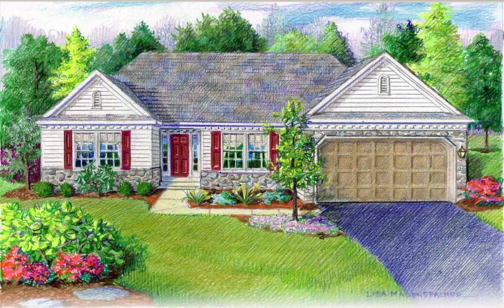
Elevation C AS2-C-OR-0523