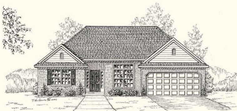
Elevation A AS2-A-OR-0521

Shown with optional: Hip roof, 10 foot ceilings, transom windows.