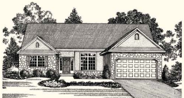
Elevation B AS2-B-OR-0522

Shown with optional: Hip roof, 10 foot ceilings, transom windows.