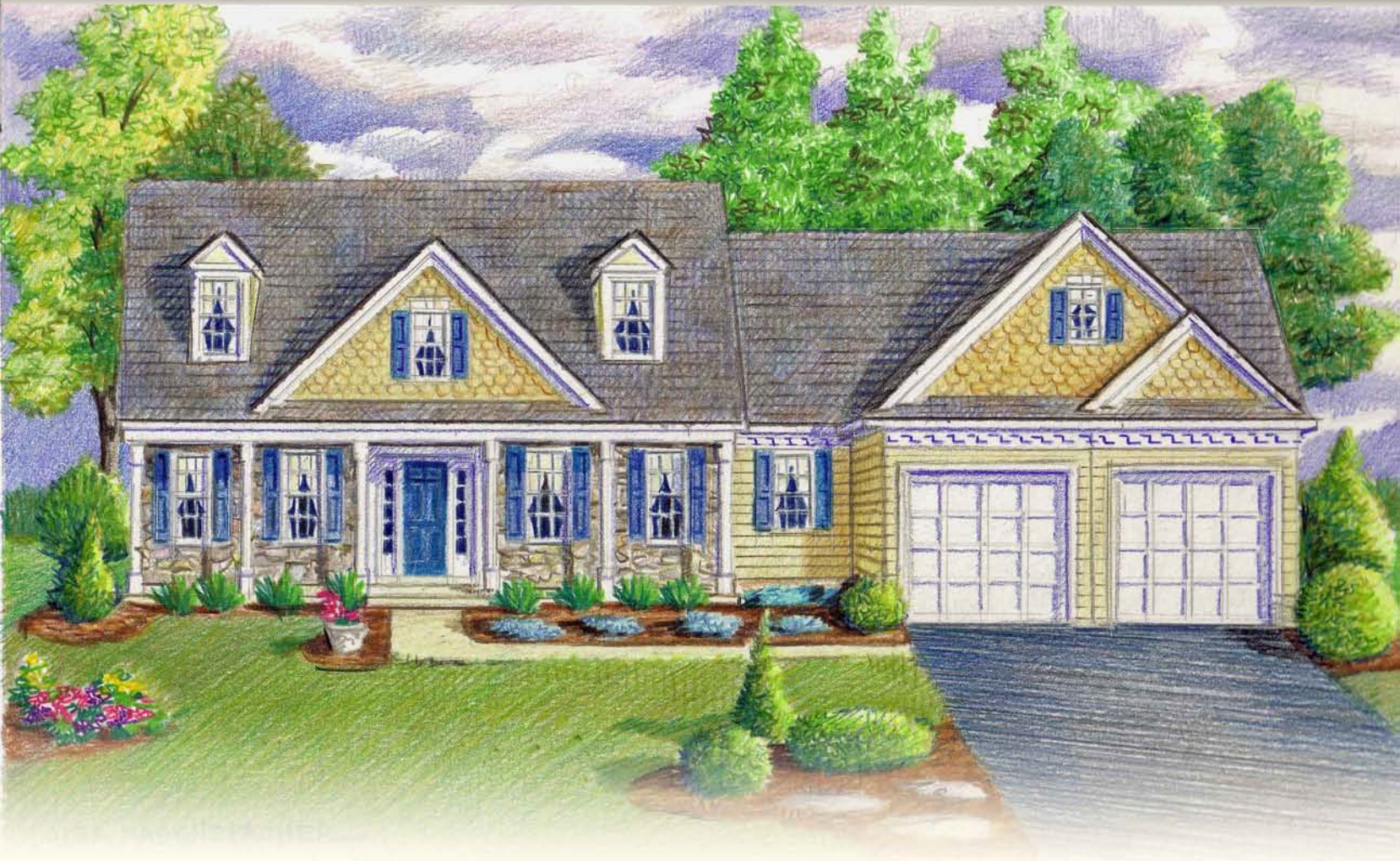
Elevation B AP-B-OR-0022

Shown with optional: Shingled siding on gables, upgrade porch posts.