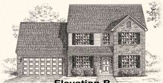
Elevation B BB-B-OR-0552

Shown with optional: Bonus room over garage, standing seam porch roof, stone wainscoting, garage door trim and front entrance sidelights